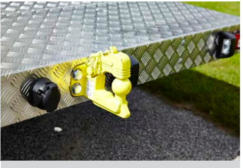
Tow bar (optional)