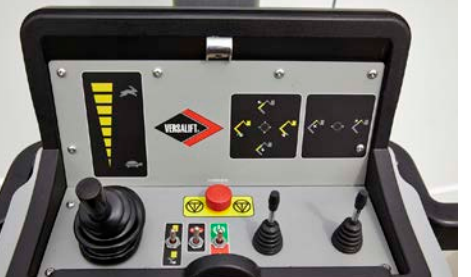
RLC (Relay Lefthand proportional Controls): Fixed outreach and 1 action at a time