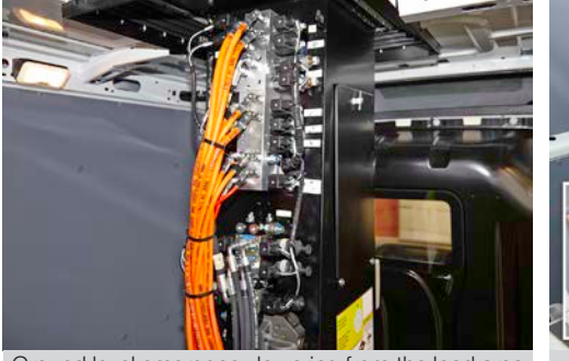
Ground level emergency lowering from the load area (pedestal mounted valve bank)