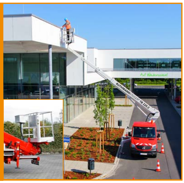
All measurements and weights are approximate and refer to the standard basic execution. Technical alterations reserved. STEIGER®, GELENKSTEIGER®, RÜSSEL® and CARGOLOADER® are registered trademarks of RUTHMANN GmbH & Co. KG