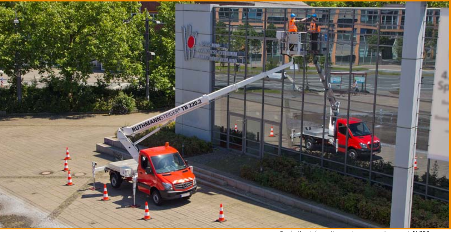
For further information go to: www.ruthmann.de/tb220en